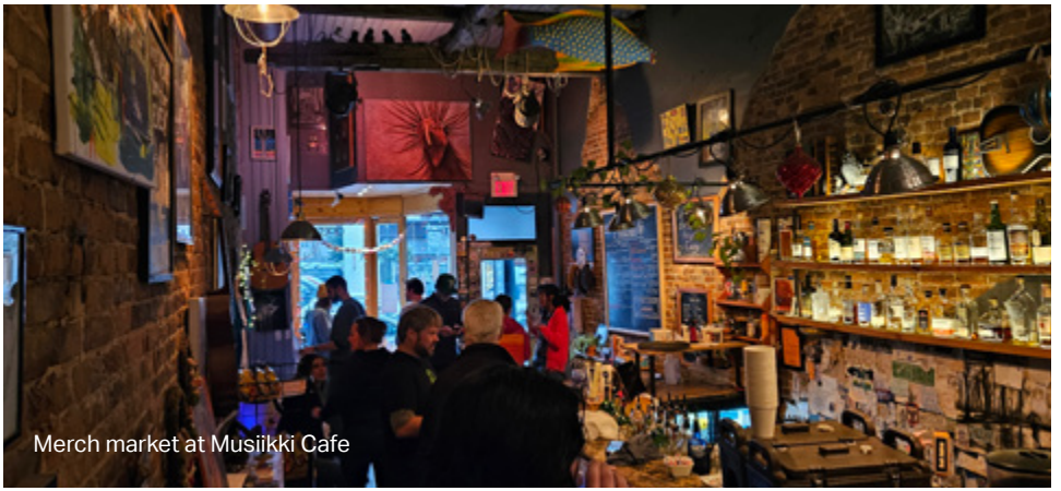
Merch market at Musiikki Cafe