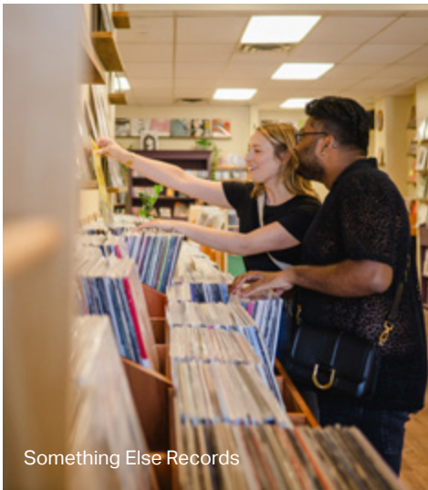
Something Else Records