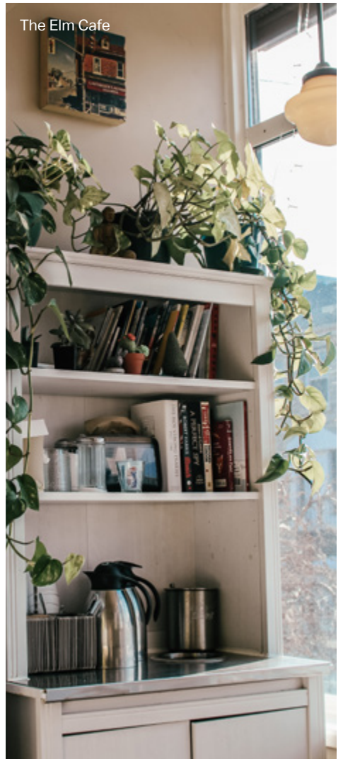
The Elm Cafe