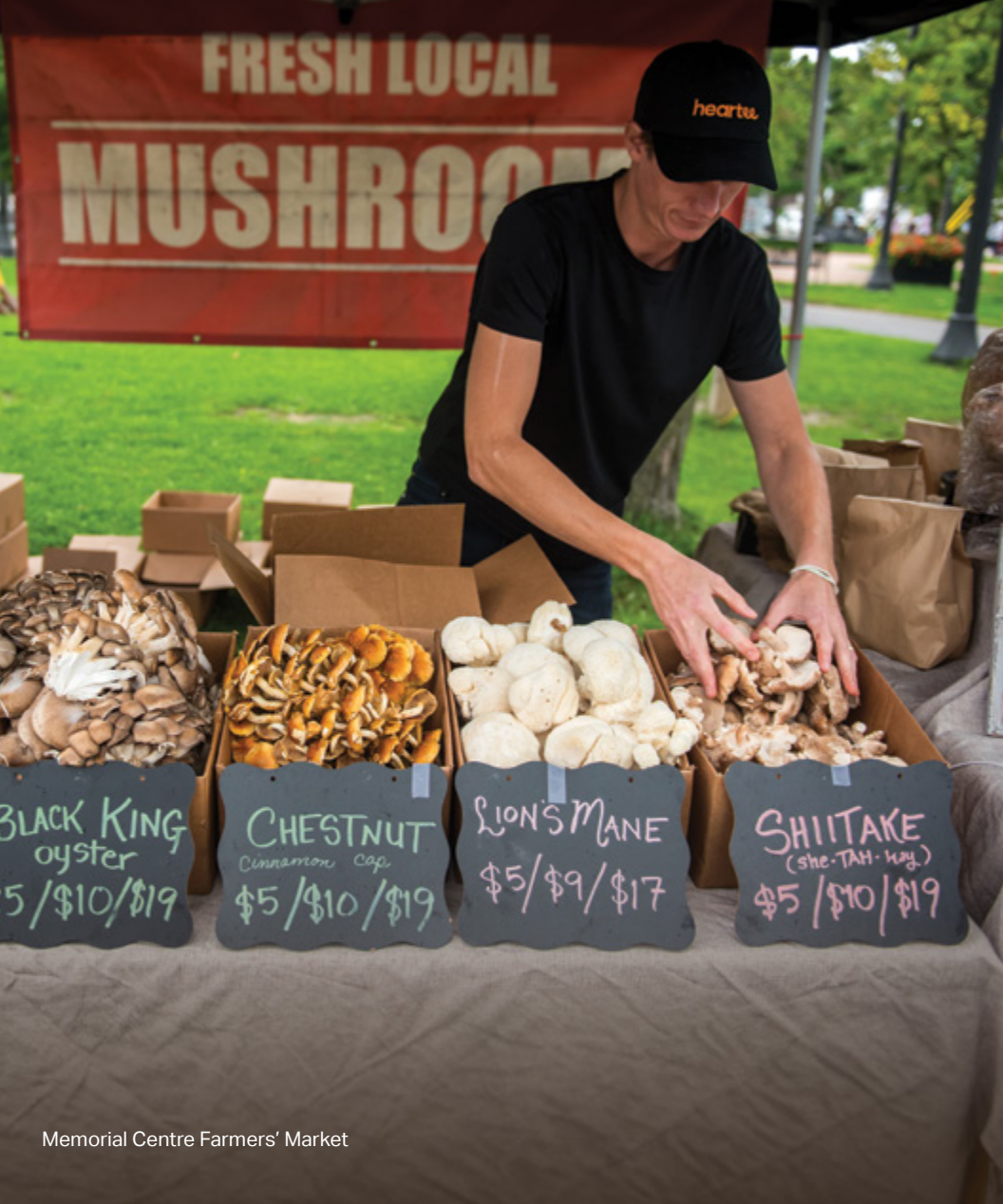
Memorial Centre Farmers' Market

Kingston is located in the heart of Frontenac County farmland. Frontenac farms feed Kingston tables, and Kingston chefs utilize fresh, seasonal ingredients from local growers and producers.