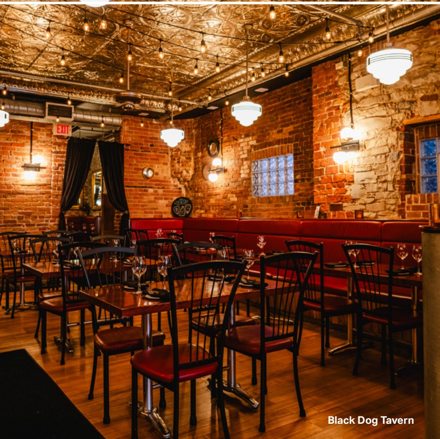
Black Dog Tavern