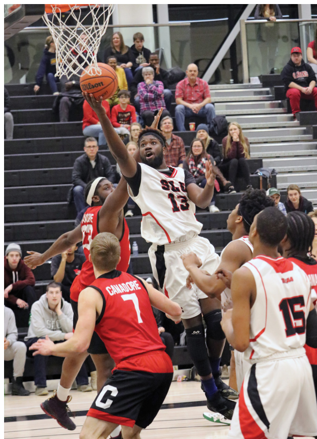
The college's Student Life and Innovation Centre features a double gymnasium, fitness centre, and meeting space.

St. Lawrence College offers 306 guestrooms (147 are double-occupancy) from May to the end of August.