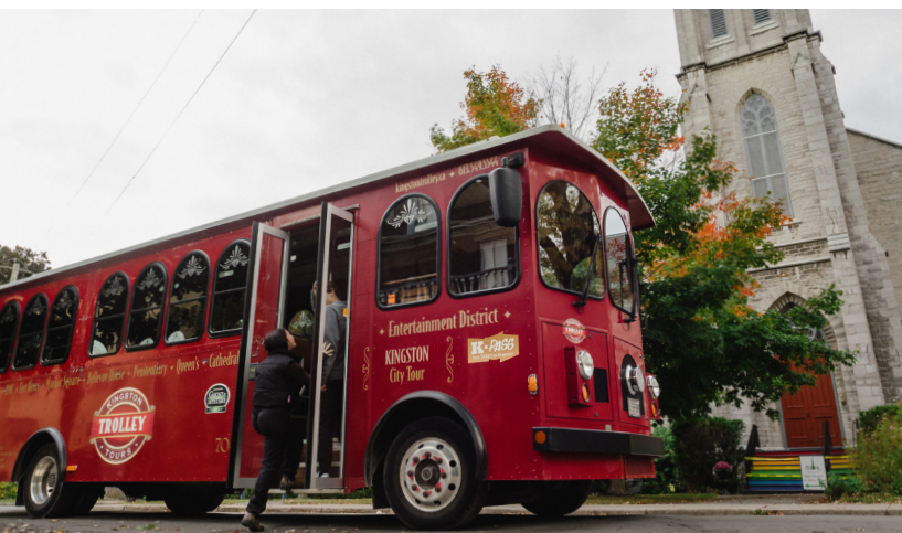
Take a guided trolley tour through Kingston and learn about the community's history.