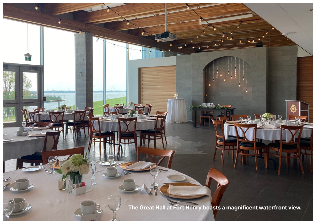
The Great Hall at Fort Henry boasts a magnificent waterfront view.

// St. Lawrence College stlawrencecollege.ca