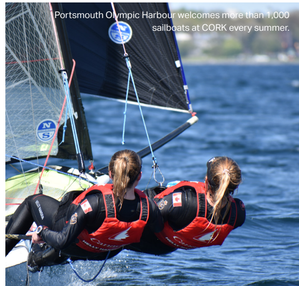
Portsmouth Olympic Harbour welcomes more than 1,000 sailboats at CORK every summer.

Built as the sailing venue for the 1976 Summer Olympics, Portsmouth Olympic Harbour hosts provincial, national, and international sailing events. Every year, Kingston plays host to more than 1,000 sail boats during the annual CORK regattas. The facility features 250 slip finger docks, large meeting and event rooms, and secure storage areas.