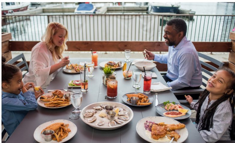
Kingston offers a huge variety of dining options for your group.