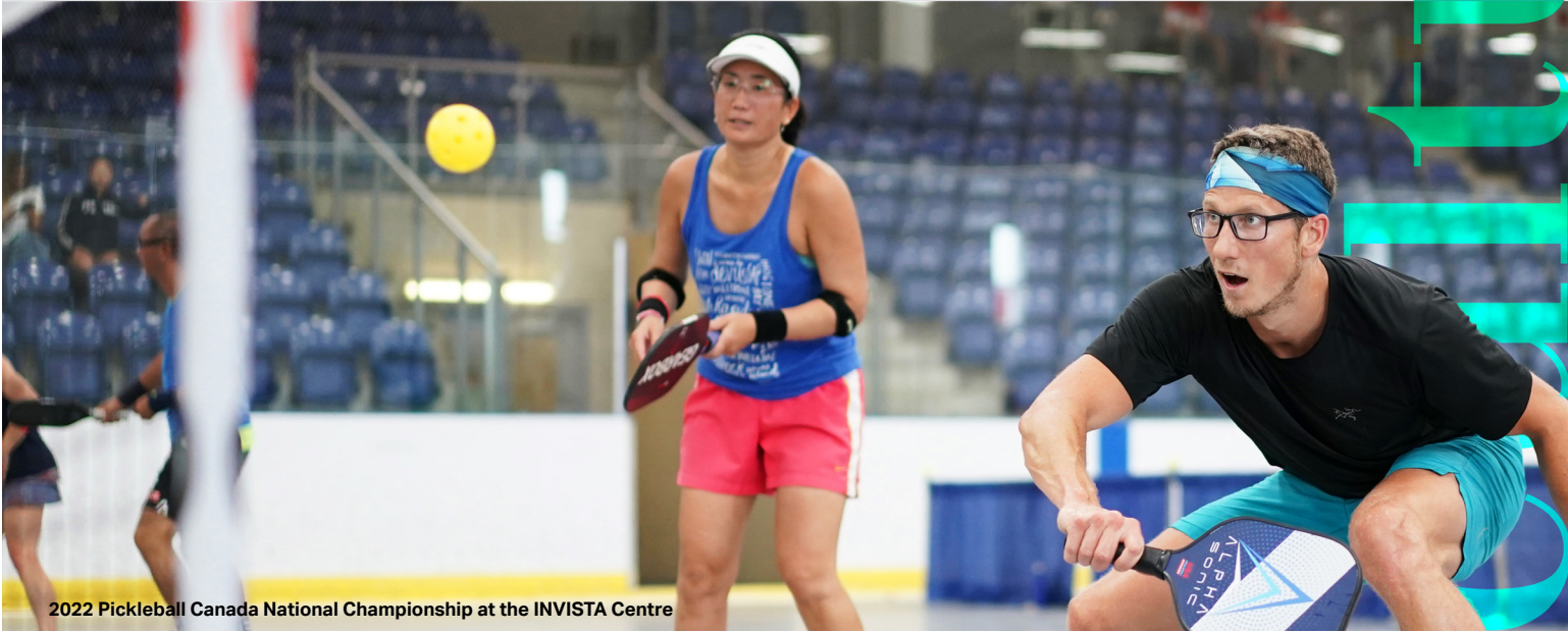
2022 Pickleball Canada National Championship at the INVISTA Centre

Kingston offers a number of dedicated pickleball courts as well as tennis courts lined for pickleball. Kingston hosted the Eastern Canadian Regional Pickleball Championships in 2017 and 2018 and the Pickleball Canada National Championship in 2019 and 2022 at the INVISTA Centre.