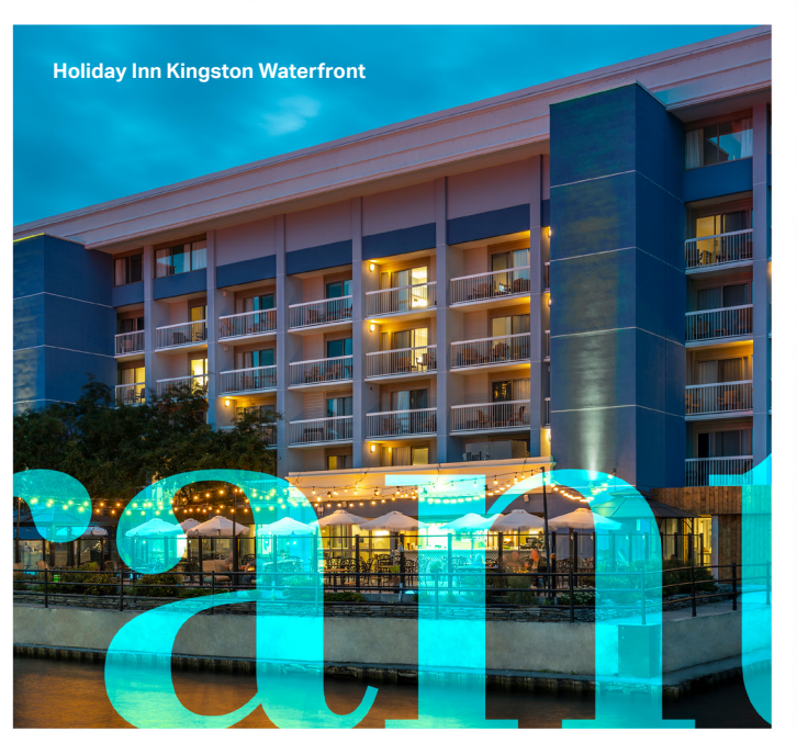
Holiday Inn Kingston Waterfront

Let Tourism Kingston help you find the perfect accommodation for your group. We will assist with site tours, RFPs, and negotiations. We will secure the best rate for you. Our dedicated Business Events Specialist can also help you find meeting spaces for your group, for strategic plannings, AGMs, technical meetings, or coaches' conferences.